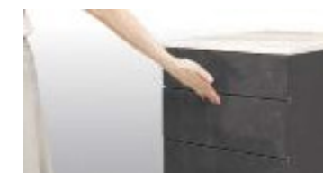
Press the drawer front