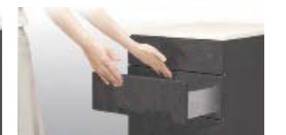
Press to close the drawer