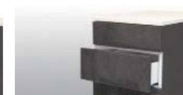
Drawer opens automatically