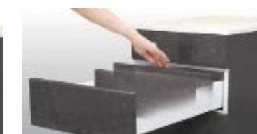
Pull the drawer for your use